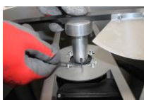
3 Tighten the screw shaft blocker