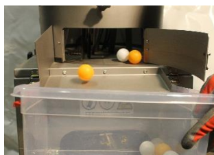
4. Open the exit lid to retrieve the trimmed flowers.