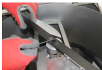
2 Loosen the central screw of the shaft.