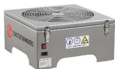
Block MT Gentle