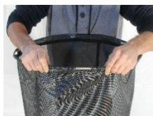
5 Connect the ends using the hitch forming a hoop.