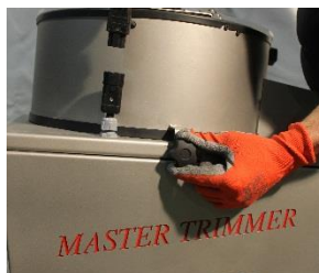
2. Screw the screws to pin up the main container and connect the engine on the top to the electrical circuit.