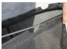
2 Insert one of the ends into the bag.