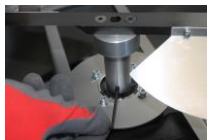
1 Loosen the lock screw shaft