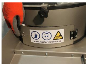
3. Leave the flowers in the container until the desired trim is obtained.