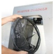
7 Insert the hoop vertically.