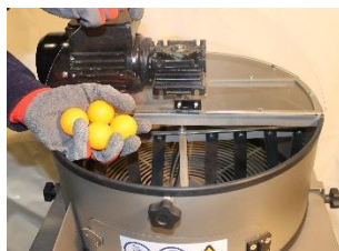
2. Put the flowers inside and close the lid.