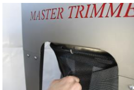
1 Pull up taking by the bag.