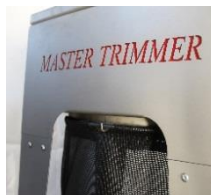
9 Attached bag.