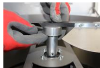
3 Adjust the blade height.