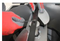
4 Tighten the central screw of the shaft.