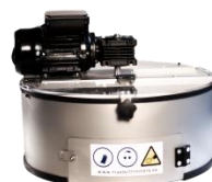
Container MT Gentle