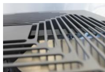
4 Close the grid and ensure that the blades don't touch the grid and they are at the desired height. (Important: keep 2mm safety distance from the grid. If not, repeat the process.)