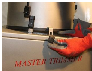
1. Attach the main container on the top of the grid with the screws.