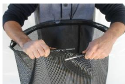
4 Until the end