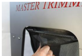
2 Bag no longer attach to hook.