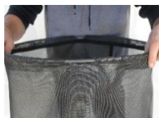
6 Hide the hitch inside the bag.