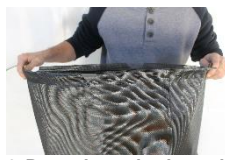
3 Pass the pole through the bag to form a hoop.