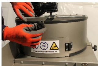
1. Open the lid of the container.

Switch on both engines. For work with the MT Gentle you have to separate the flowers from the branch. Use the machine with freshly cut flowers. (Important: The flower must be clean without any branch out.)