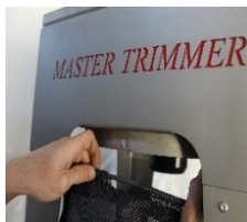
8 Attach the hoop to the hooks.